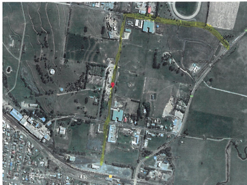
Map 2: Old Blayney Dewatering Facility – Transport Vehicle Route